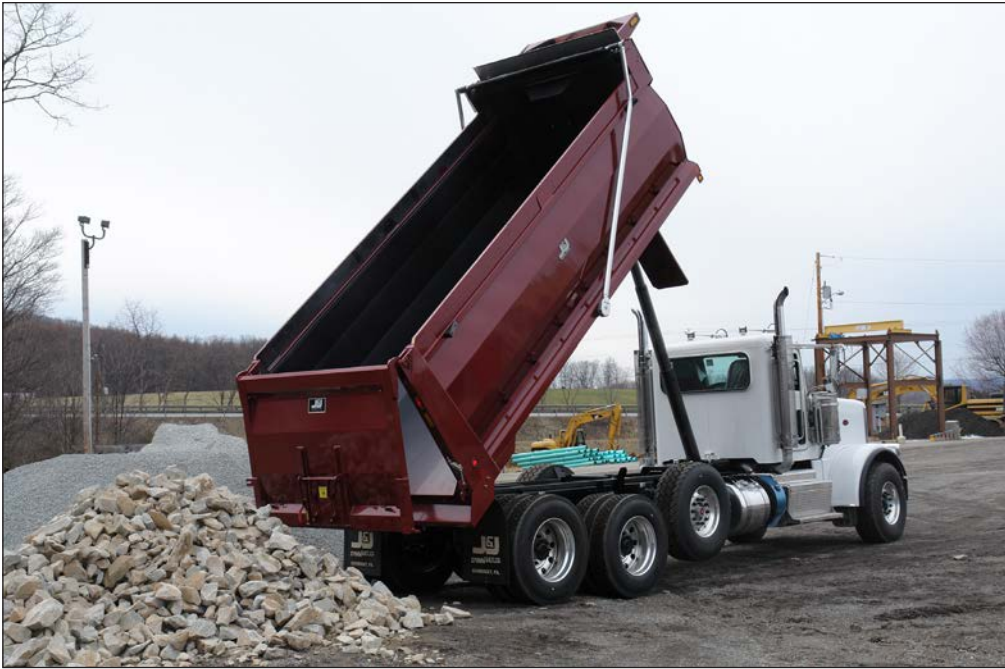
Rely on J&J Ultra Light dump bodies to deliver power and performance every time.