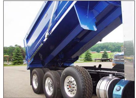
The absence of crossmembers reduces the weight of these trucks.