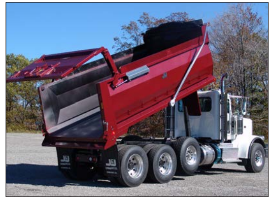
The hydraulic lift tailgate option prevents tailgate damage from large objects and functions as a conventional tailgate for standard aggregate hauling.